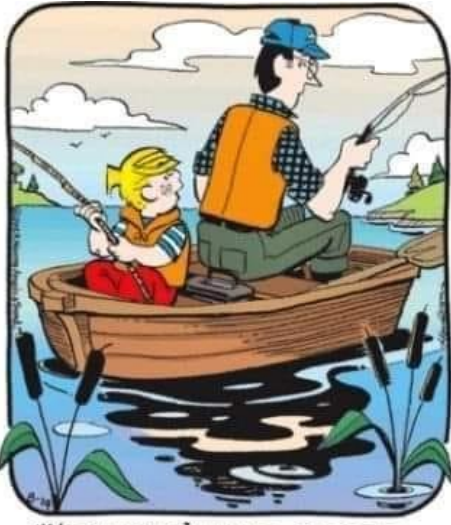
"YA THINK WE'LL HAVTA GO TO THE FISH MARKET AGAIN AFTER THIS?"

The representatives of our Club found it an informative and worthwhile outing.